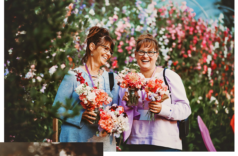
Mommy's Little Monster Photography

Our second sold-out tour experience came with our every popular Alaska Grown catered meal, make your own bouquet and of course our guided tour through our farm.